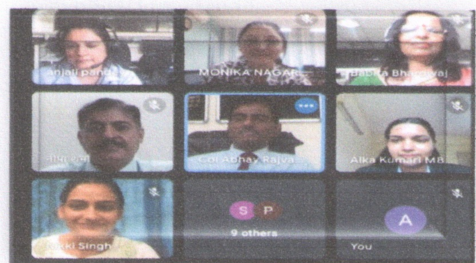
Students sharing their point of view during debate

Outcome of the Event- The participants from various colleges got an opportunity to share their view in favour and against the Agnipath Scheme. They also got clarification on few points through the deliberations of both the judges.